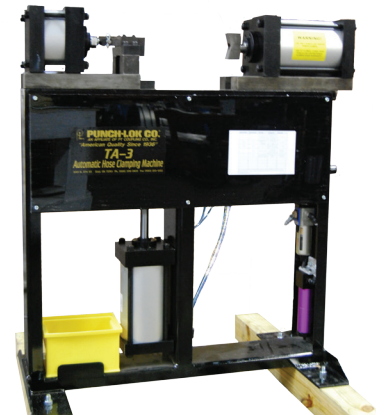
TA-3 ™ with 8" hose kit